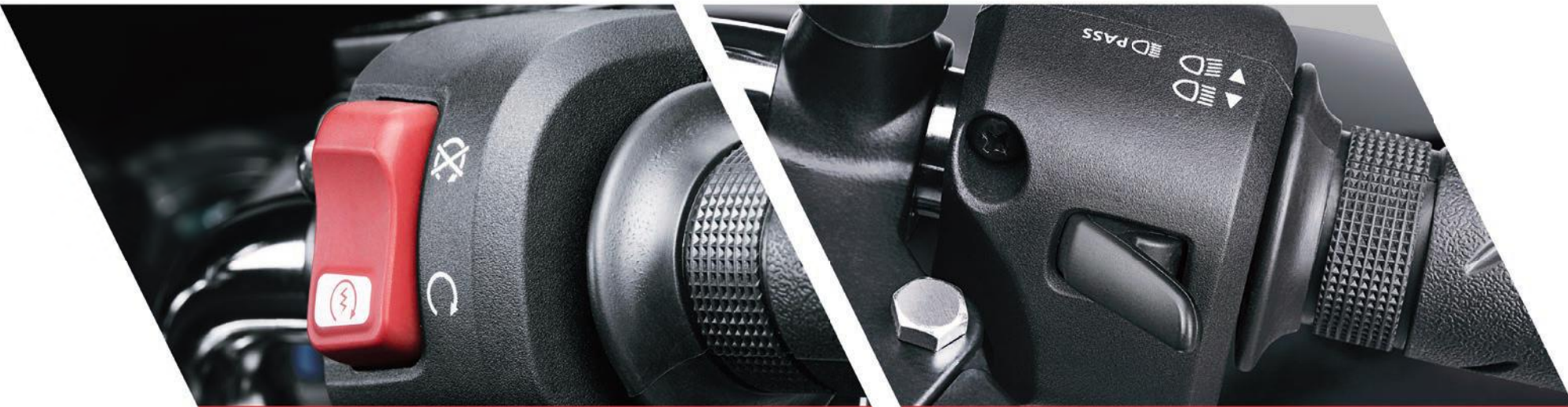
ENGINE START/STOP SWITCH

The DC Headlamp gives consistent illumination while riding, irrespective of the speed and riding conditions.